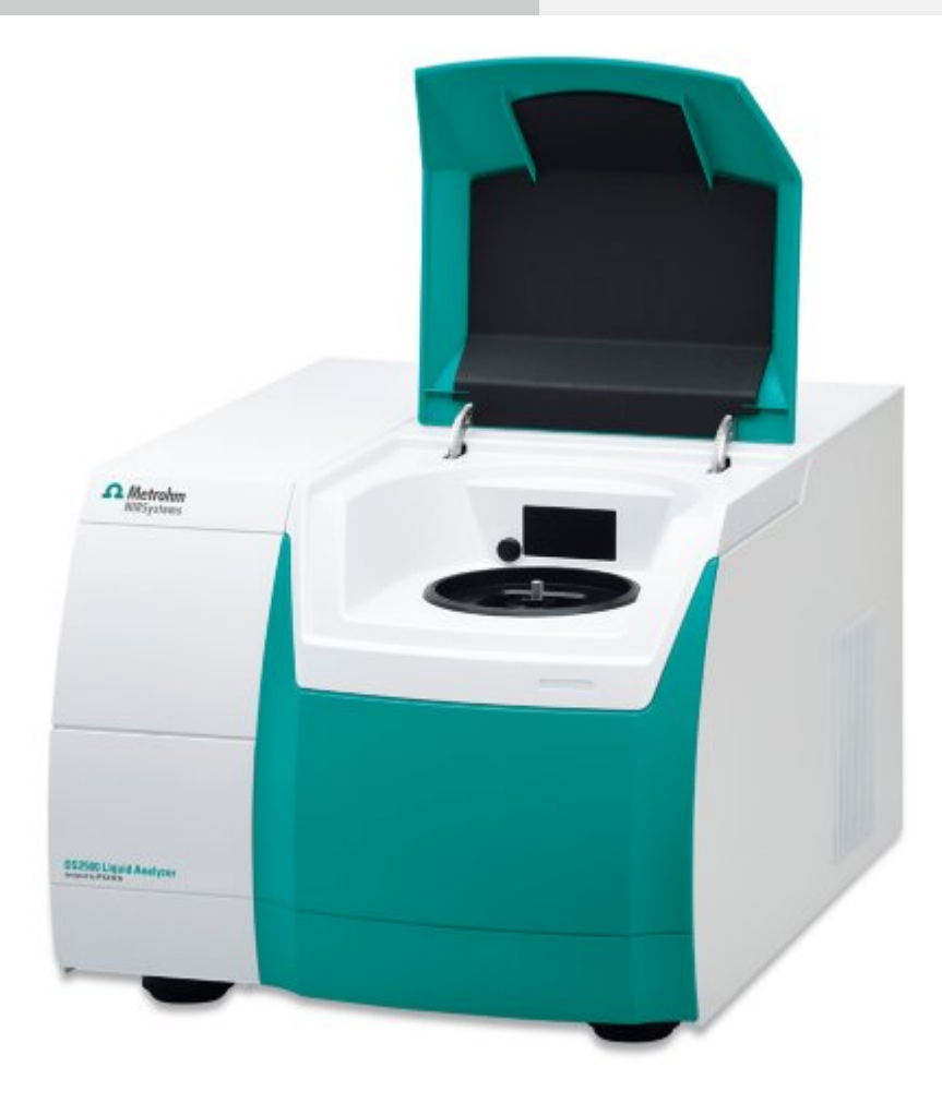
Figure 1. Metrohm NIRS DS2500 Liquid Analyzer used for the quantification of several QC parameters in BIIR samples.