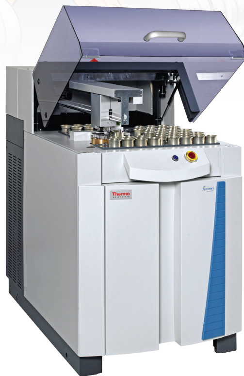
Thermo Scientific ARL PERFORM'X Sequential XRF

The results obtained show that good accuracy and precision can be achieved with the ARL PERFORM'X Sequential XRF instrument. This instrument is well suited for the analysis of Cl in petrochemical products.