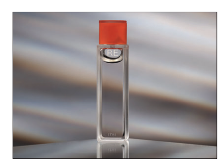
Figure 1. Sealed certified wavelength reference.

The internationally recognised standard covering the accreditation of calibration and test laboratories is ISO/IEC 17025. This standard evaluates the actual technical competence of the laboratory, unlike ISO 9001, which only relates to the laboratory's quality management system. In sourcing CRMs, it would therefore be a prudent risk management strategy to only obtain such materials from suppliers holding this type of accreditation. Accreditation to ISO/IEC 17025 is awarded by national accreditation bodies like the United Kingdom Accreditation Service (UKAS) in the United Kingdom or the American Association for Lab Accreditation (A2LA) and National Voluntary Laboratory Accreditation Program (NVLAP) in the USA. Most of these bodies are members of ILAC, the International Laboratory Accreditation Co-operation, formalised as a co-operation in 1996 when 44 national bodies signed a Memorandum of Understanding (MOU) in Amsterdam. This has facilitated