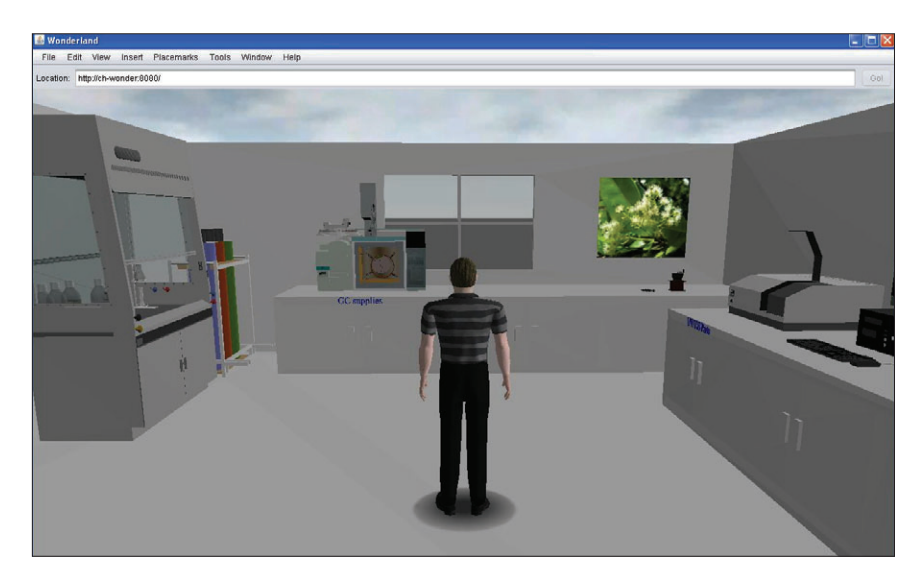
Figure 3. Wonderland environment used to build a spectroscopic laboratory.

though you would think that spectroscopy would certainly lend itself to more imaginative interactive learning materials. Do we have, as a community, too many isolated innovators who we need to bring together?