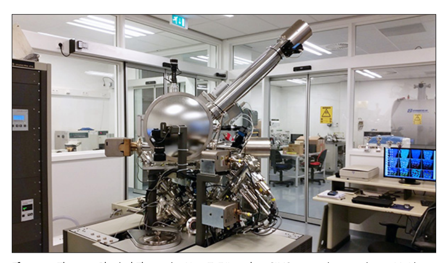
Figure 1. The new Physical Electronics NanoToF II tandem SIMS system in operation at M4I in Maastricht.

Working together with some of the major instrument vendors in our field they are now generating data at the rate of 100s of GBytes/day. These large amounts of data need to be rapidly and securely stored in a location which is also designed to be able to serve this data back to the individual researchers when they need to begin the task of data analysis and