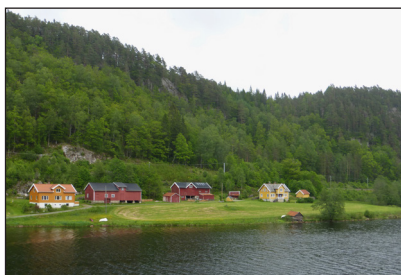
Farm cluster in Gyland anno 2022.

members from the local neighbourhood—young Vikings eager to prove themselves in raids to foreign lands? Or perhaps equally likely, and much less violent, according to the Encyclopaedia Britannica (online version), the Normandy coast was repeatedly raided by