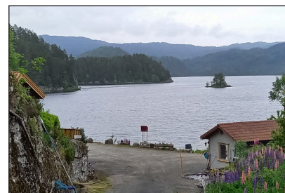
Looking across 1000 years of human presence at the island “Storøya”, shown in close-up below.

It was a distinct pleasure to try to complete this important family link of the founder of the TOS, alas