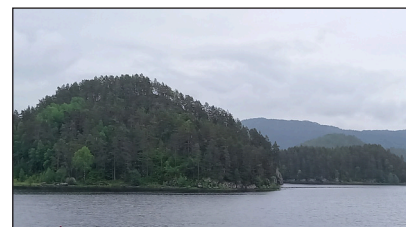
Close-up of “Storøya”, where Viking age artefacts are alleged to have been found. Could this be where “all of science-backed sampling” originated?

without his own fulfilment. But this is nevertheless an interesting historical background for the international sampling community.