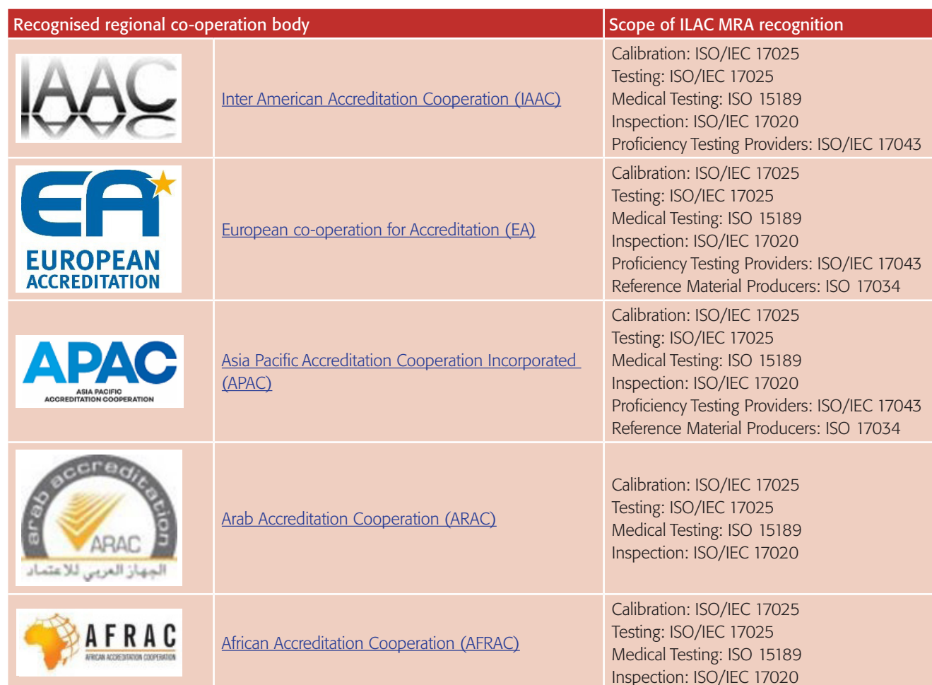
Table 1. ILAC regional co-operations (taken from International Laboratory Accreditation Cooperation, ilac.org ).

the organisation to give itself QM system tools to support the work of its people in the production of technically valid results. In addition, for the first time, there is an increased emphasis on the assessment (and measurement) of risk.