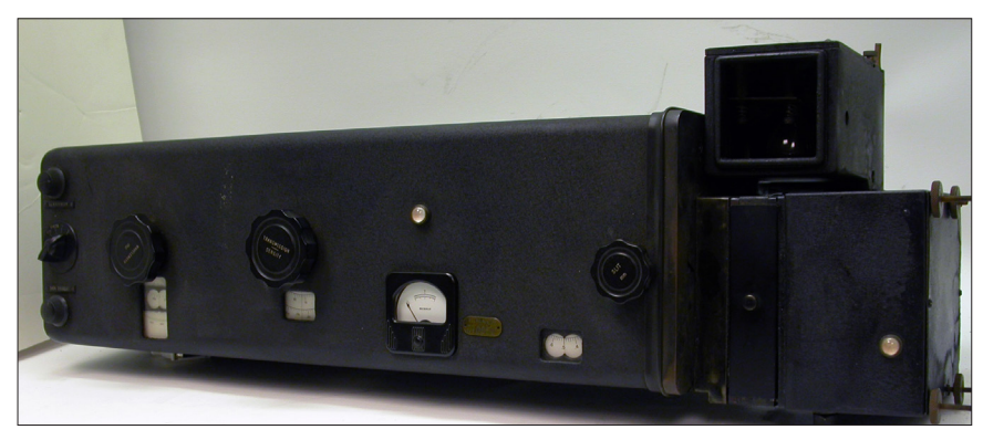
The Beckman DU spectrophotometer.

4<sup>th</sup> Generation: from 2021 forward.