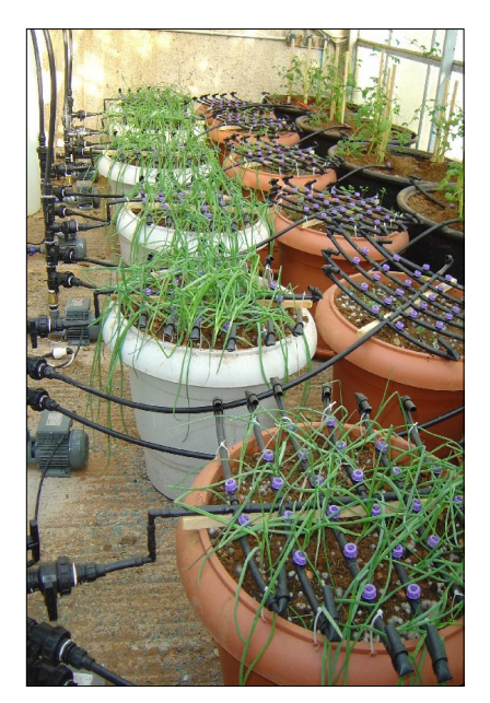
Figure 1. Photograph depicting the three parallel greenhouse series for cultivation of green onions, carrots and potatoes. The permission of Elsevier to reproduce this figure is acknowledged.

suprapure HNO<sub>3</sub> and microwave digested, diluted by distilled water and analysed in triplicates by inductively-coupled plasma mass spectrometry (ICP-MS) for their Cr and Ni content. Blank samples and samples containing Standard Reference Material NIST 1573A (tomato leaves) were also digested and analysed. Similar preparations were made for samples of tub soil collected at 0–10 cm and 10–20 cm depths and each was analysed in triplicate by ICP-MS for levels of Cr and Ni. Blank samples and samples containing