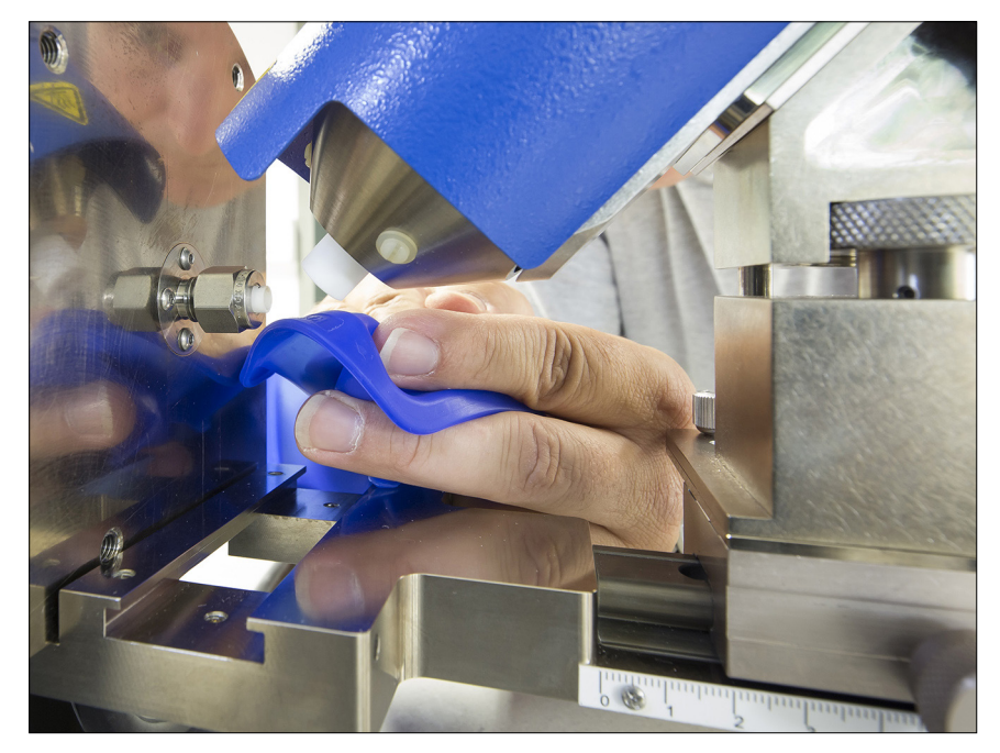
Figure 2. A silicone rubber baking mould is being subjected to positive-ion DART analysis in surface mode. The DART source (pointing down from upper right) is mounted at an angle of 45° relative to the entrance of the ceramics sampling tube (left side) of the Vapur Interface. Recessing the angle mount by 20 mm (marked scale) provides enough space to manually fit the object into the ionisation zone. With the helium gas set at 300°C this set-up leads to abundant PDMS ions.

For silicone rubber objects, DART analyses were performed in surface mode. The DART-SVP ionisation source was mounted at an angle of 45° relative to