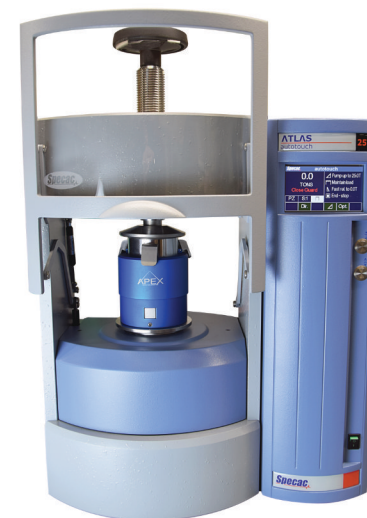
Specac's Atlas® Autotouch Press & APEX™ Quick Release Die

Read on to discover how pressed pellet sample preparation even improves the quality of your XRF spectra and enables accurate quantification to be obtained.